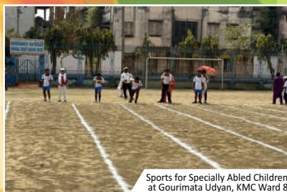
Sports for Specially Abled Children at Gourimata Udyan, KMC Ward 8