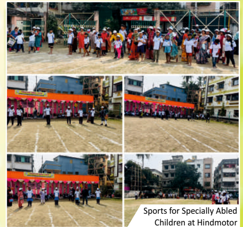
Sports for Specially Abled Children at Hindmotor