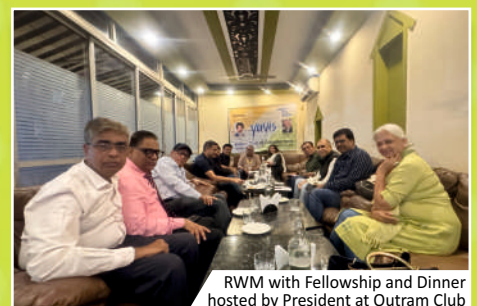
RWM with Fellowship and Dinner hosted by President at Outram Club

"We meet every Friday at 7 PM at EITMA, Oswal Chambers, 5th Floor, 2 Church Lane, Kolkata - 700001".