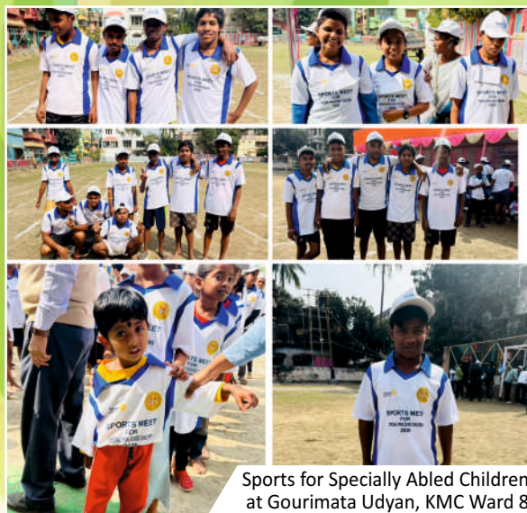
Sports for Specially Abled Children at Gourimata Udyan, KMC Ward 8