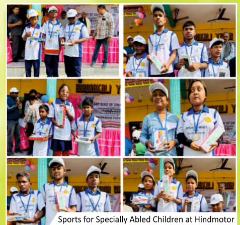
Sports for Specially Abled Children at Hindmotor